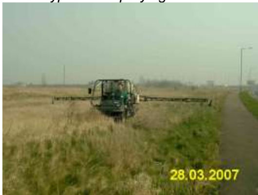
Figure 2. Site work photos 1-8. Glyphosate spraying