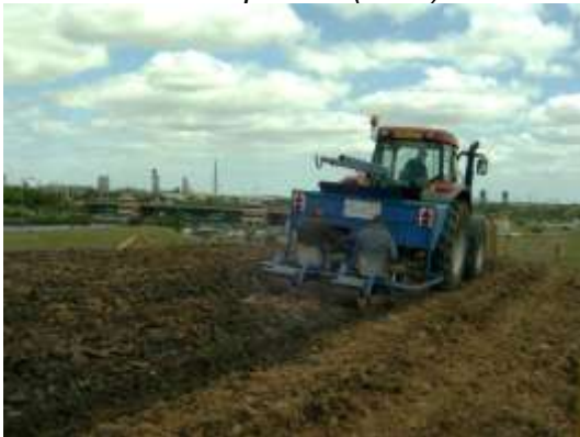
Miscanthus planter (Bical)