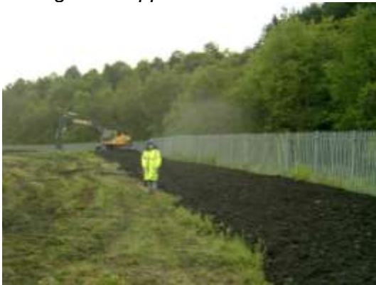
Placing loose-tipped ex situ amended soil