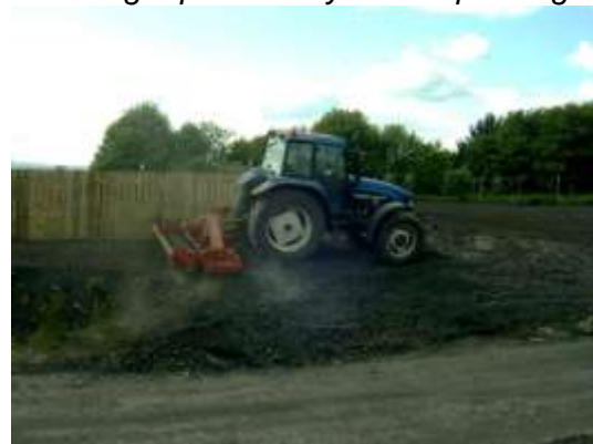
Disking replaced clay soil for planting