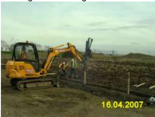
Erecting rabbit fencing on industrial land