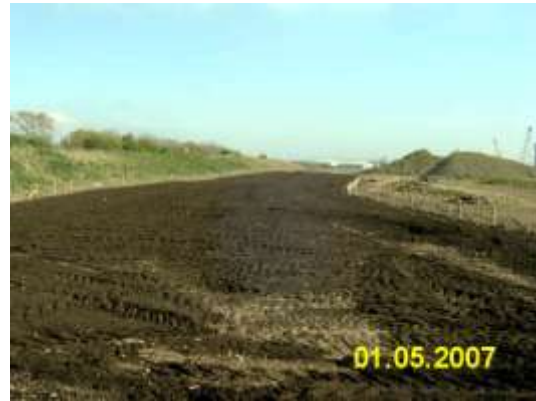
In situ amended brownfield site